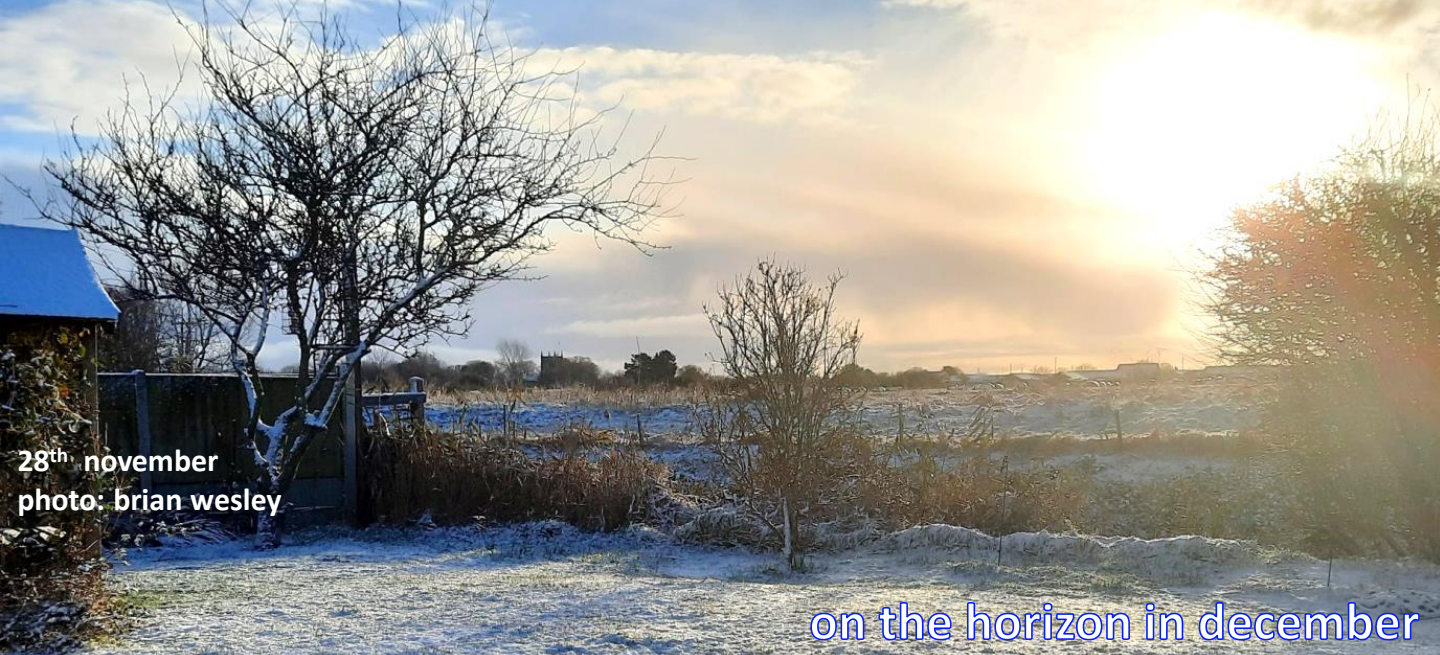
28 th november